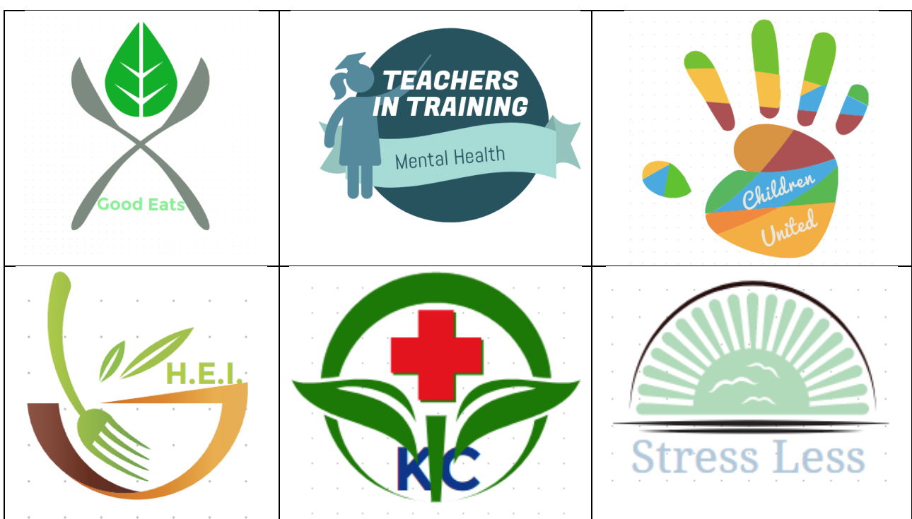
Figure 1. Public health students' design work related to logos

The instructional design procedures used in this course are known as the ADDIE approach which stands for “analysis, design, development, implementation, evaluation” (Branch, 2009, p. 2). The media that they designed could be used in their lesson plan and teaching. Students worked on this capstone assignment for eight weeks in groups of two or three students. The total number of the groups was 11. Students regularly recorded their analysis, design, development, implementation, and evaluation process into a shared Google document which was accessible to the instructors and the group members. Course instructors provided weekly consultation throughout the project. At the end of the eighth week, the students implemented their training with an authentic audience.